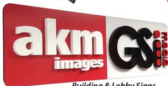
Building & Lobby Signs