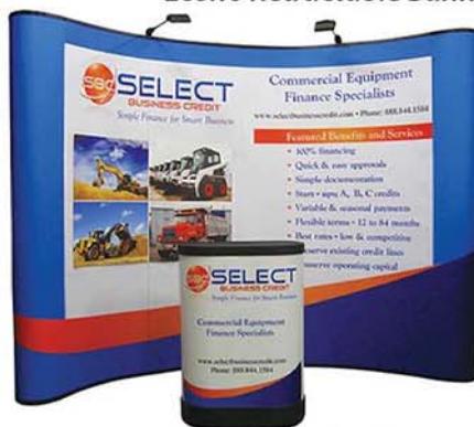
Pop-up Trade Show Displays