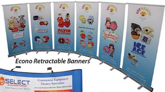
Econo Retractable Banners