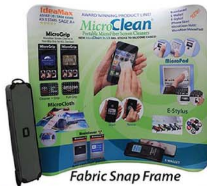
Fabric Snap Frame