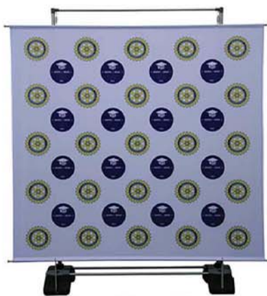
Billboard Step & Repeat